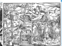
Pillory, stocks and other instruments for punishment as depicted in the Corollario Criminali Carolina 1532. Forensic of the copy in the municipal library of Trier, Germany, (23/02/04).