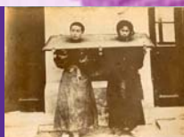
Double Cangu in China. Photography taken around 1900