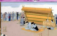
"Man and woman undergoing public exposure for adultery", from: Silver, J.M.W. (1867): Sketches of Japanese Manners and Customs. Illustrated by Native Drawings. Reproduced in Facsimile by Means of Chromolithography, London, 37.