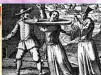
Women is shamed in a so called "Shrove's fiddle". Germany?, 17th century.